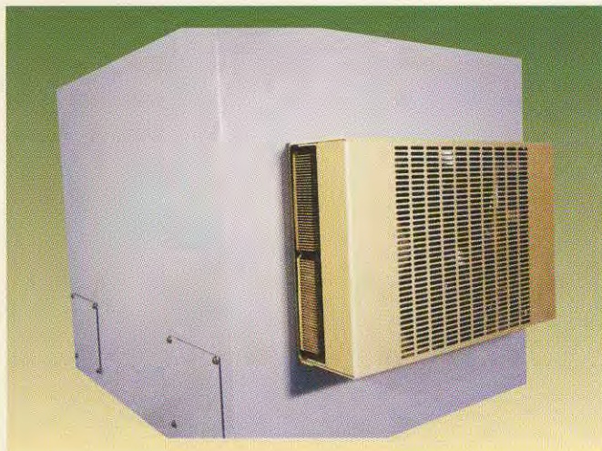
Thermoelectric Cooling America Corp.'s AHP-1200XP solid-state thermoelectric cooling system weighs 40 lb and measures 18×12.65×9.69 in.

For more information, Circle 499 or visit www.controleng.com/freeinfo .